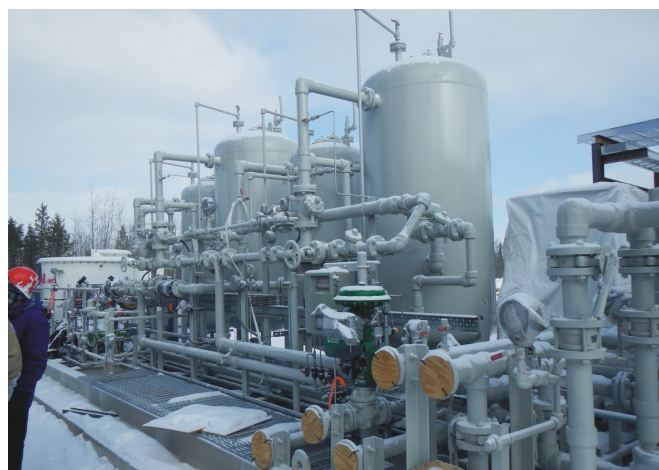
Installation of the water treatment plant at our joint SAGD Project.

In the fourth quarter of 2013, we received approval from the AER for our HCSS Project application. It is anticipated that we will develop a thermal demonstration project on our properties followed by a commercial expansion project on one half section of land located on section 10-92-13W5 of our joint Sawn Lake oil sands properties. This application, submitted in early 2012, was an application to modify our previously approved in-situ demonstration project for a well to test thermal production on our Sawn Lake oil sands leases. This modification changed the vertical CSS well earlier approved, into a thermal recovery project to test 2 wells that use a horizontal application of CSS. Our proposed thermal recovery project will be located on the north half of section 10-92-13W5. The proposed thermal recovery project location is approximately 1.4 kilometers away from the nearest hard packed road. Currently waiting on the preliminary results of the SAGD Project to fine-tune our HCSS Project design before we initiate start-up operations.